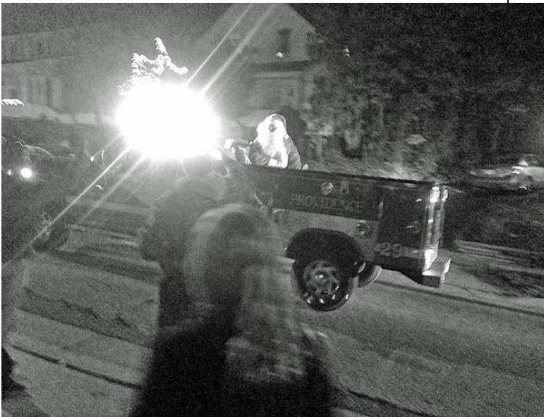
Santa on Overbrook