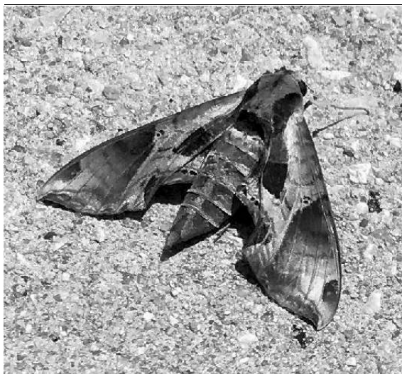
St. Albans Rd., Sept. 7, 2017: Pandorus Sphinx Moth resting in a gutter, Jack-o'-lanterns on a lawn.

Neither burglar alarms nor regular lighting made the top 10.